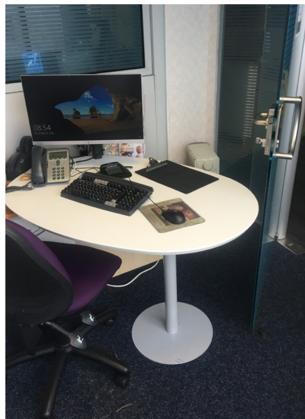
Carpet tiles at Nationwide Building Society before removal.