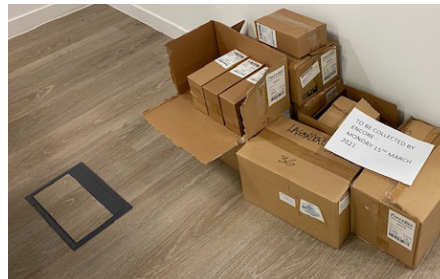
Crockery donation ready for collection by Encore Environment

As part of its key operational values to reduce carbon footprint, minimize waste and support communities, Cast turned to Encore Environment to find a new home for the office furniture.